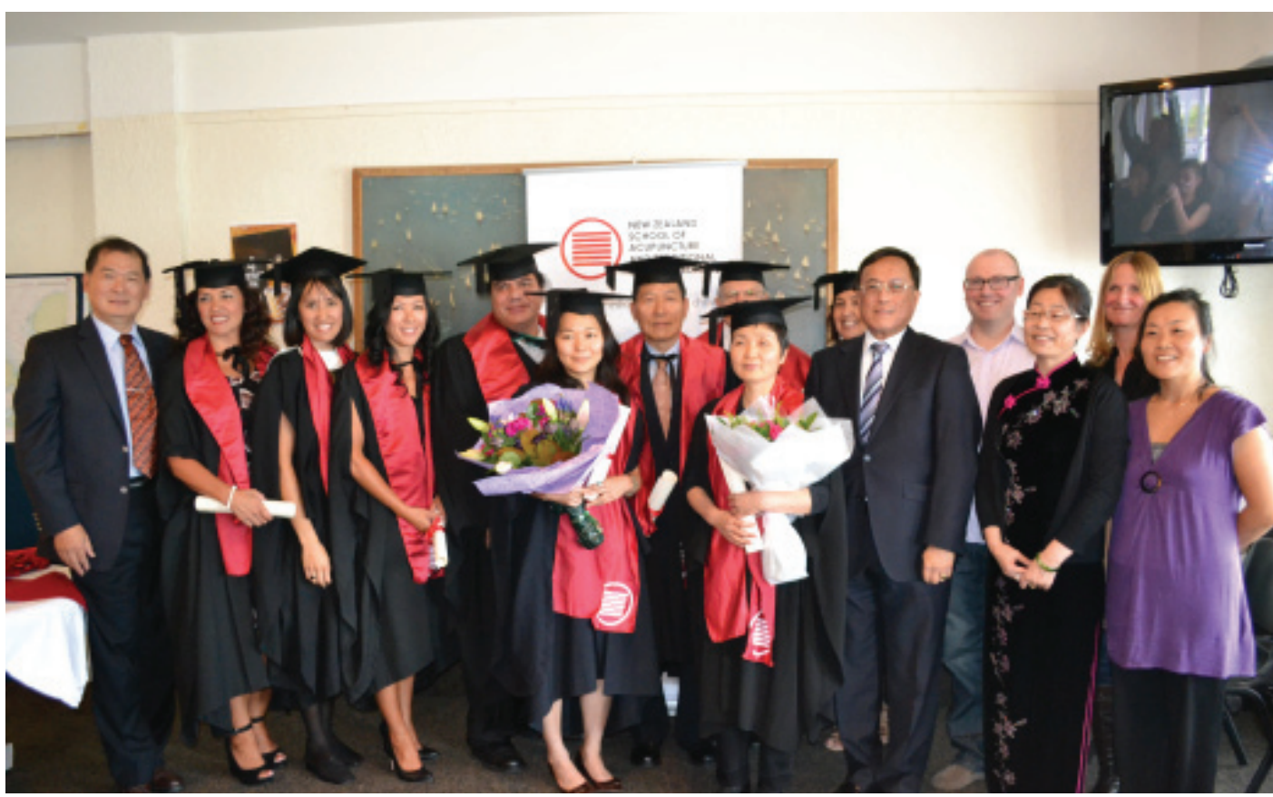
Auckland graduates 2012

"That was an awesome, practical introduction. It was wonderful to see the treatment working on women who had little or no other options," she added.